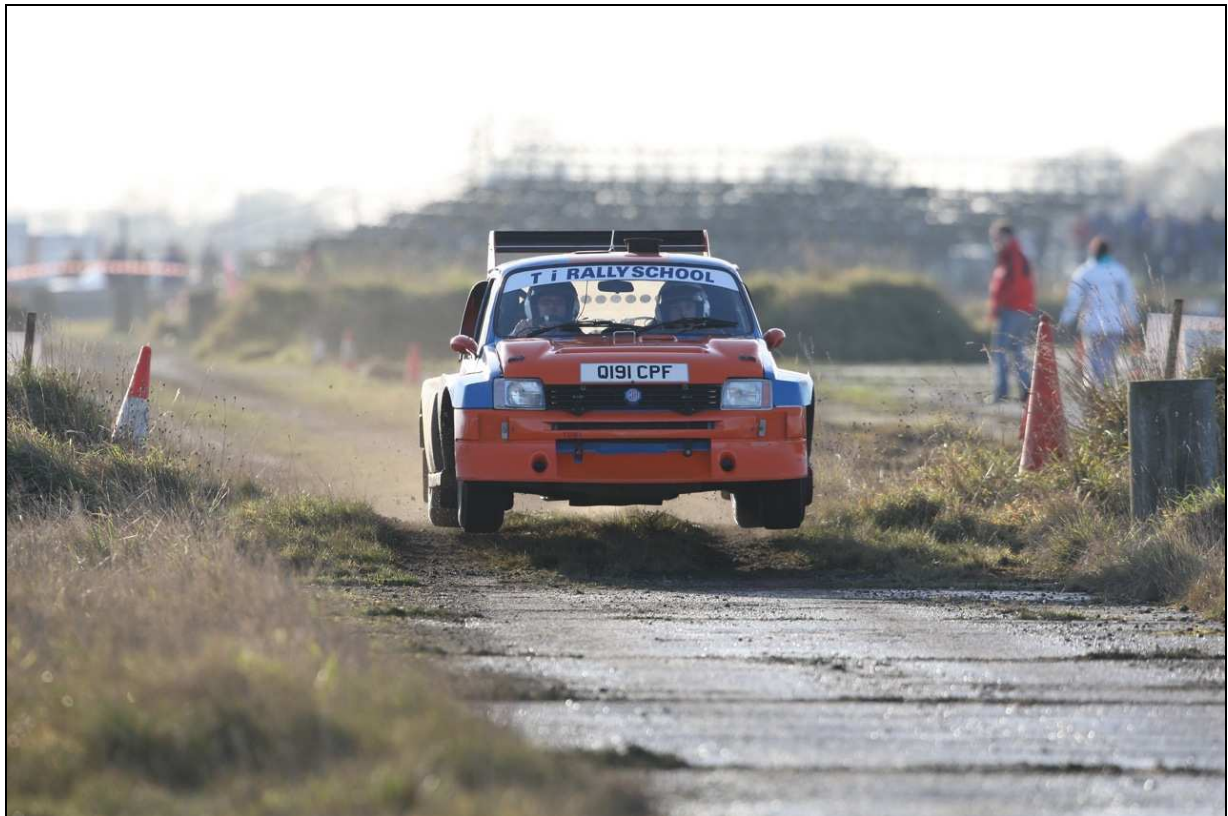
2009 Winners: Phil Gallagher / Mick Gallagher